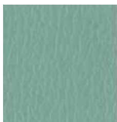
T74 Dusty Jade