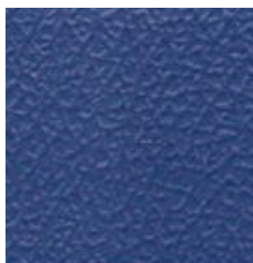
T85 Pacific Blue