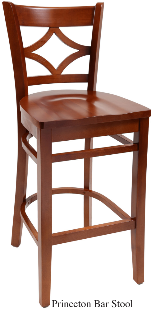
Princeton Bar Stool