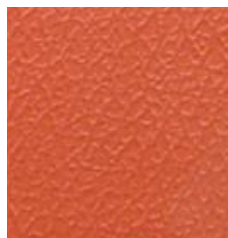
T21 Burnt Orange