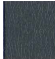
T150 Shadow Grey