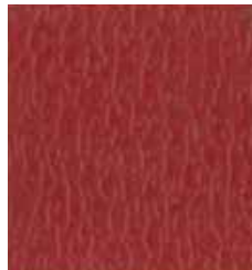
T72 Candy Apple