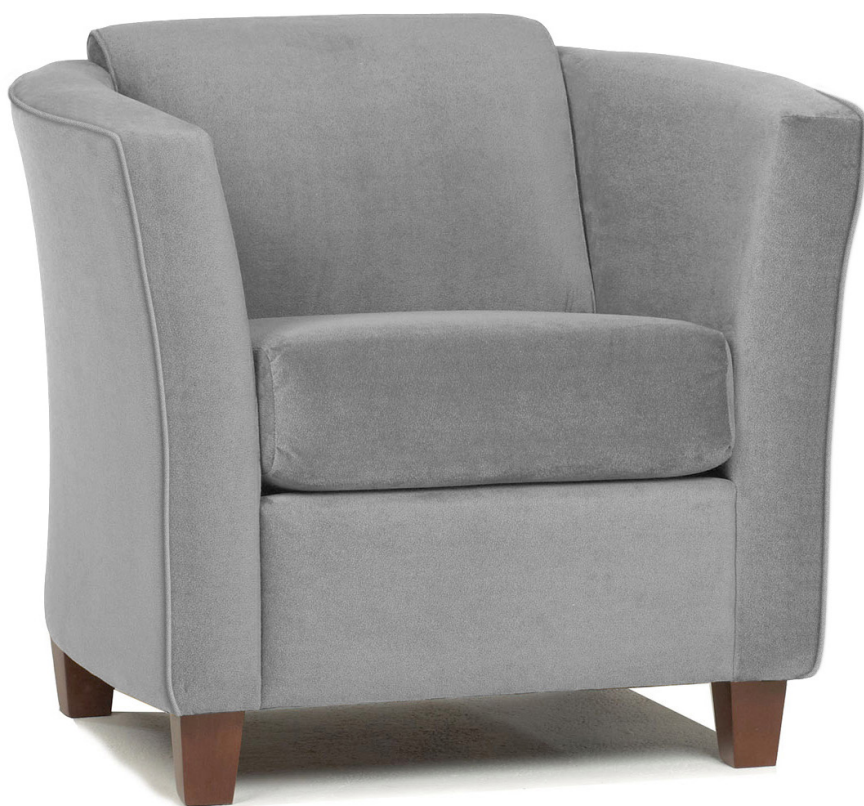
Accent Chair 871 Series